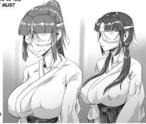
ASSISTANT SHRINE MAIDENS

THEY'VE ALL GOT HUGE BREASTS WITHOUT EXCEPTION, SO I CAN AGREE THAT THE MAIDEN SERVING AS THE VESSEL HAS AVERAGE SIZED BREASTS.