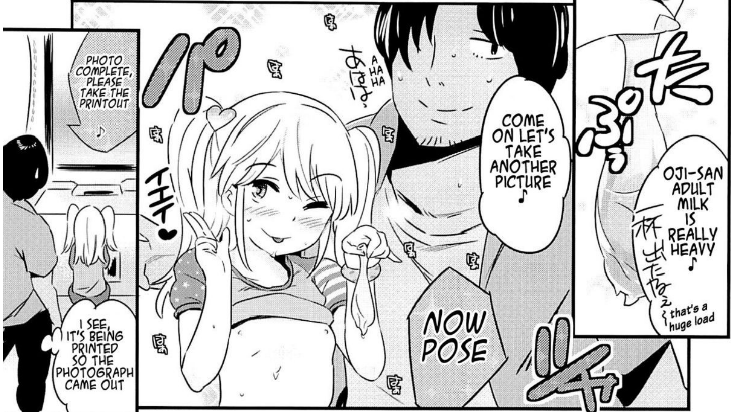
PHOTO COMPLETE, PLEASE TAKE THE PRINTOUT