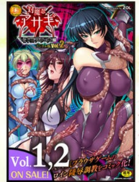
Lilithコレクション 対魔忍アサギ 決戦アリーナ編