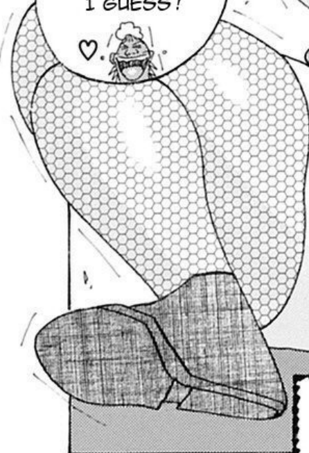
QUEEN ROSARIE'S SECRETARY, POPORI-SAN (370) B 109 W 72 H 112

WELL... I JUST LIKE SEEING BOOBS, I GUESS! ♥