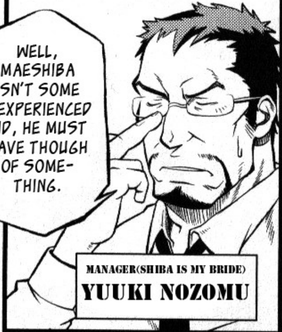
MANAGER(SHIBA IS MY BRIDE) YUUKI NOZOMU

WELL, MAESHIBA ISN'T SOME INEXPERIENCED KID, HE MUST HAVE THOUGH OF SOMETHING.