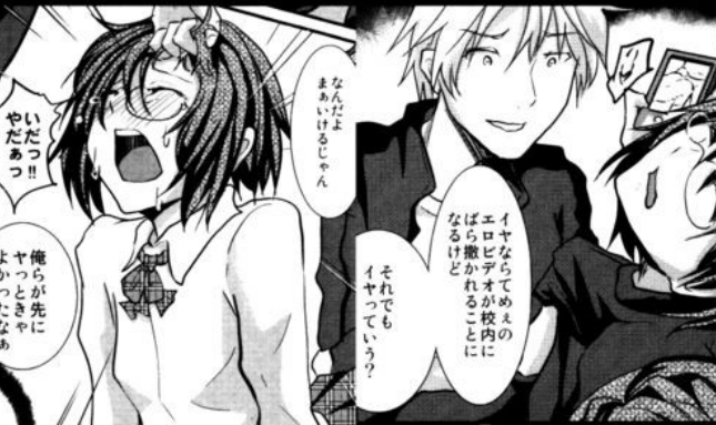
threatening to release the video if he resisted.

Now then, please enjoy this volume of the story.