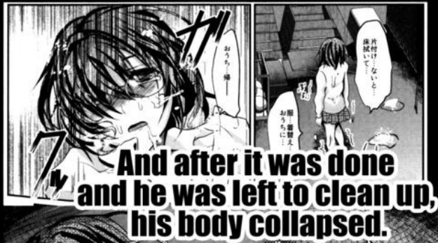
And after it was done and he was left to clean up, his body collapsed.