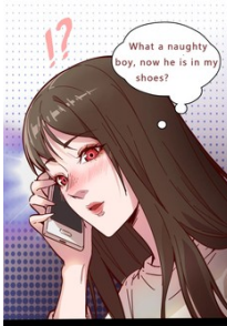
Master finally aware of my existence. I felt my body is shrieking continuously, and finally some room for a short break.